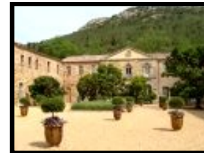
Abbaye de Frontfroide