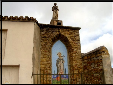
The Signadou, Fanjeaux, France

For Information Pictures Application Forms